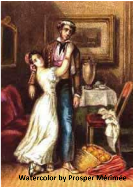
Watercolor by Prosper Mérimée