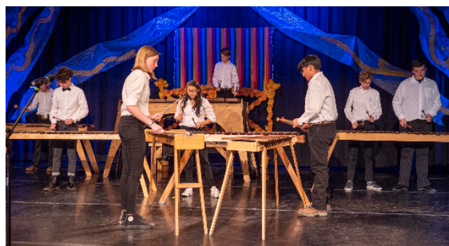
Camino de Paz School Marimba Ensemble