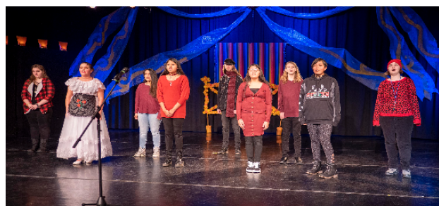
Moving Arts Española Choir