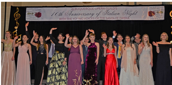
10 th Anniversary Italian Night