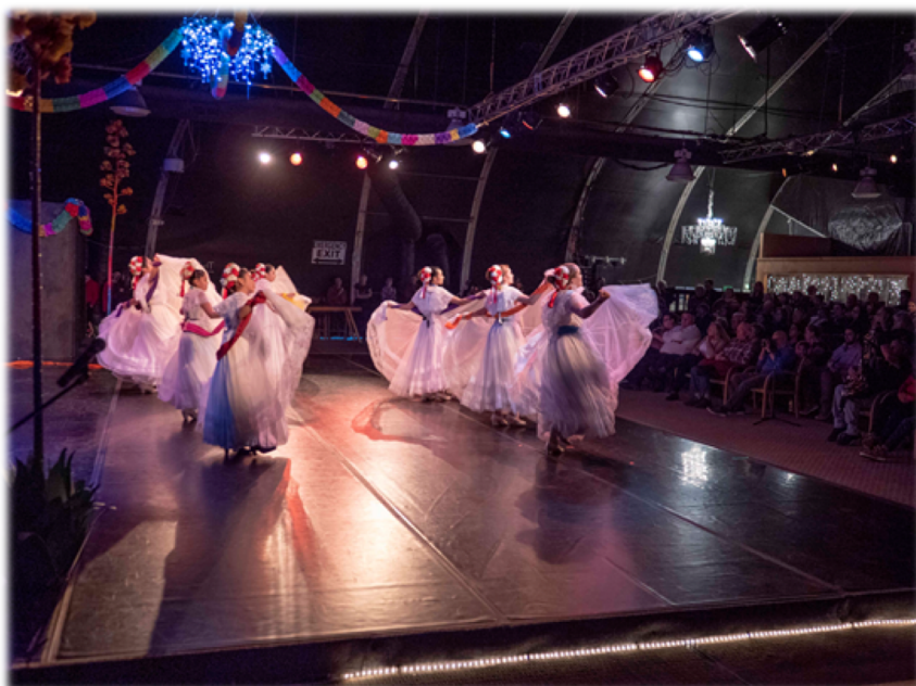
The Moving Arts Folklorico Dancers