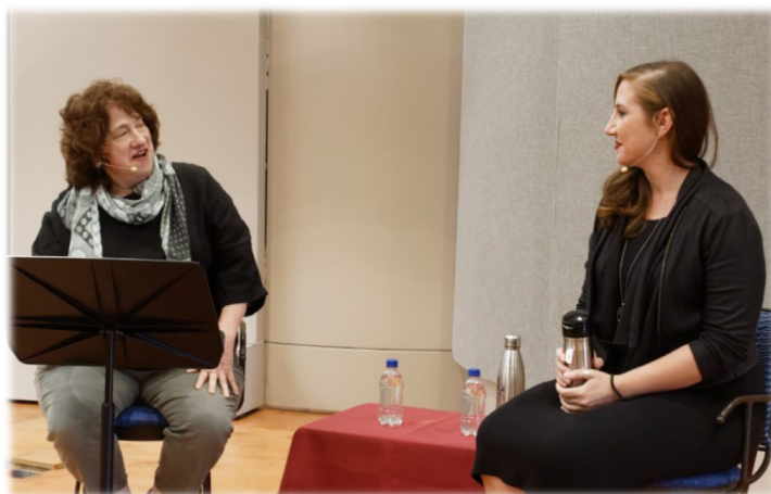
Meet the Diva