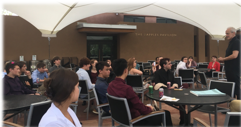
Youth Night at The Thirteenth Child