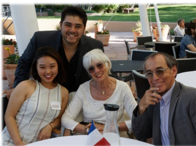
Meet the Apprentices Party