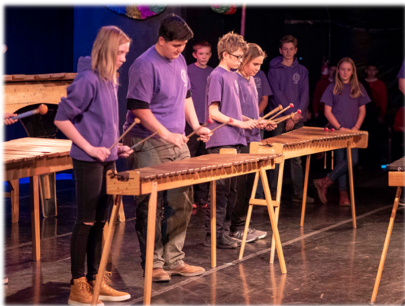
Camino de Paz School Marimba Ensemble

Thanks to added benefits and elevated levels of membership in the guilds, EVOG continued to attract members at the Partner, Donor and Contributor levels this year. EVOG continues to actively grow and learn and to impart our enthusiasm for opera and the arts to our friends and neighbors. Our members continue to work to connect our community with the Santa Fe Opera and all it has to offer. We are grateful for the support and friendship of all of the member guilds of New Mexico.