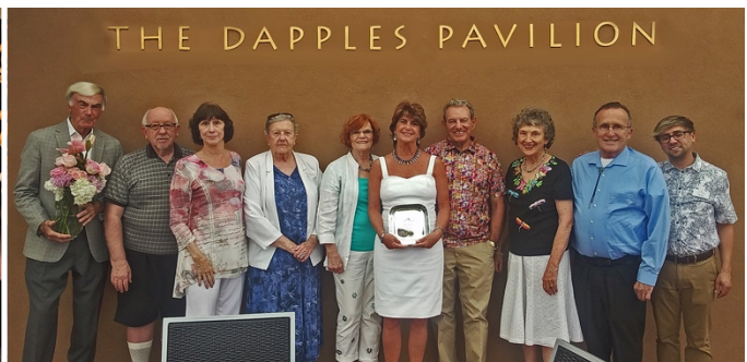
2019 Volunteer of the Year