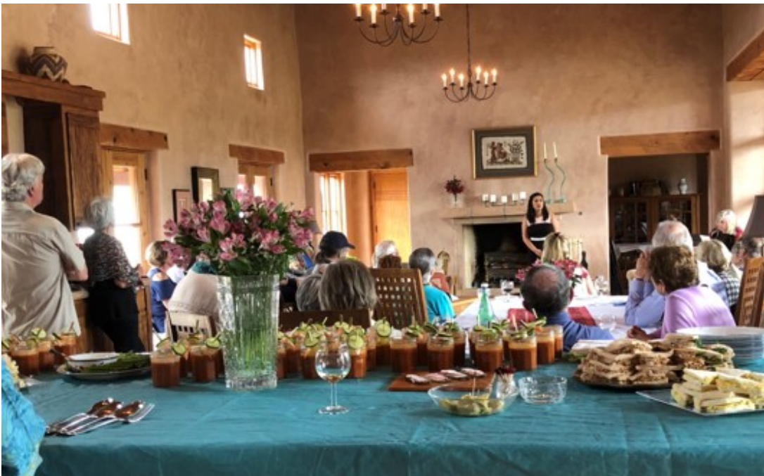
Scenes from our annual membership appreciation brunch, hosted by the Taos Opera Guild Board of Directors and featuring performances by students from the Taos Opera Institute.