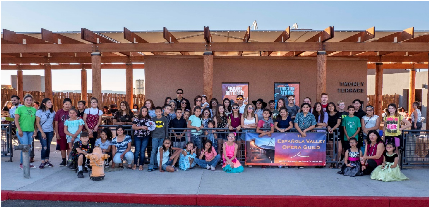
Española valley youth and their families attend EVOG's dessert reception before the Youth Night dress rehearsal of Madame Butterfly .